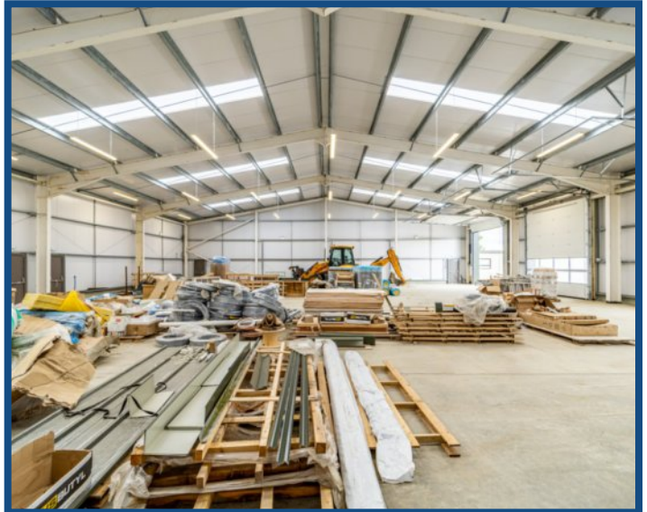
Internal View of Warehouse