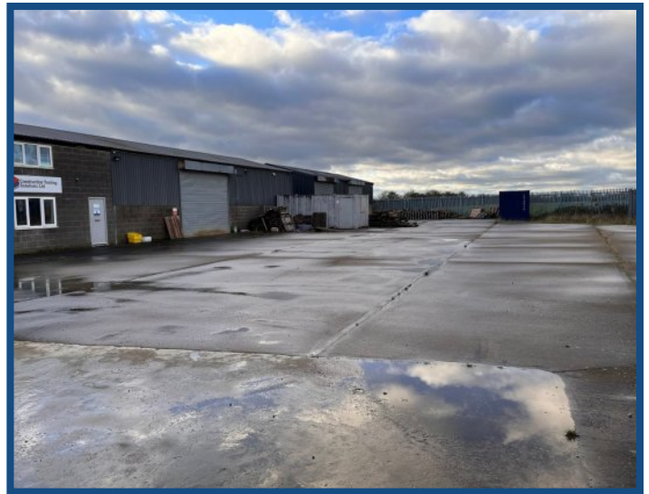
General View of Concreted Yard Area