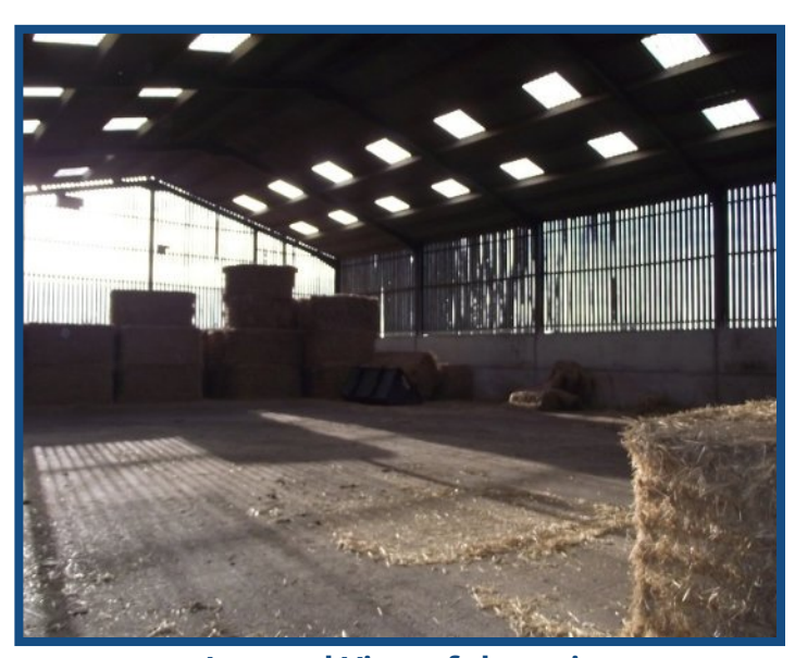
Internal View of the unit

E: enquiries@woodmoore.co.uk T: 01636 610906