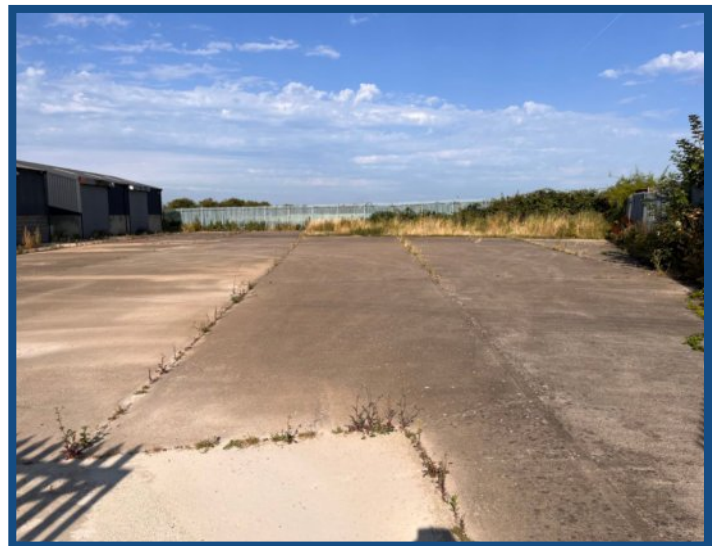
General View of Concreted Yard Area