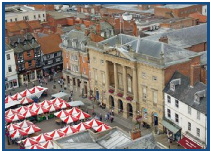
General View of Market Place