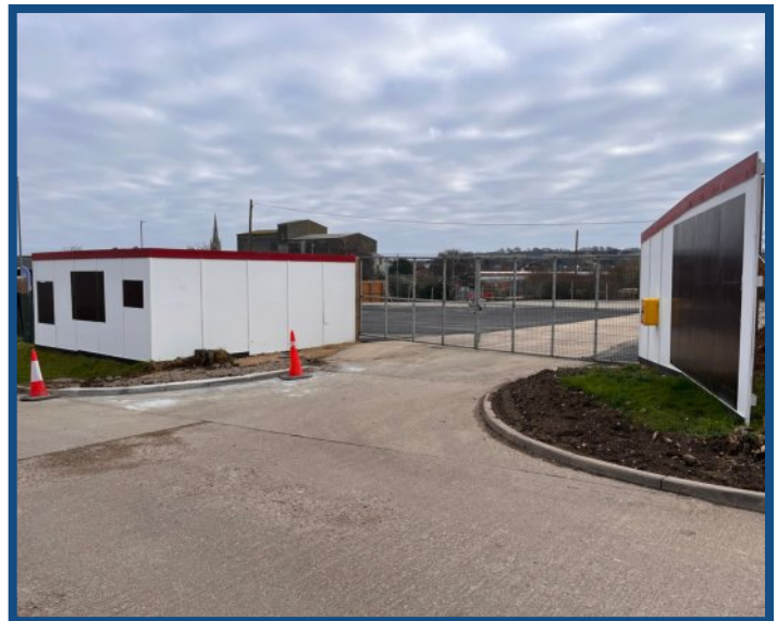
General View of Site Entrance From Dysart Way